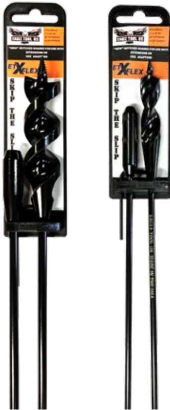
36” Notched Extension

Kit 2 provides the ability to change any 3 flat cable bit shank to a 1/4” Quick Change shank. It is available in 2 styles: Auger and Screw Point. Each style is available in 3 bit diameters. Each style includes a notched shank, a Quick Change Hex Adaptor and an allen wrench.