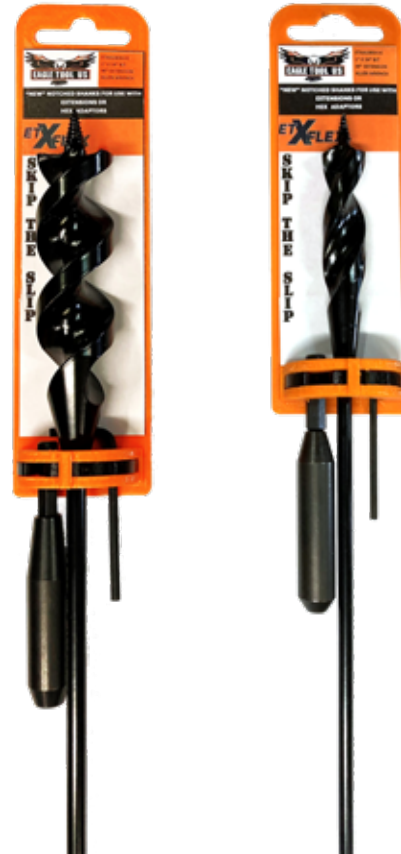
Quick Switch Hex Adaptor