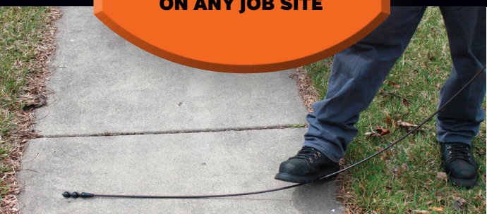
Flexible 1/4" spring steel shank