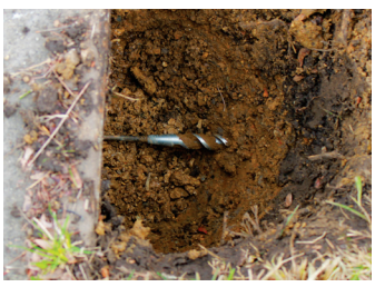
A small hole on either side of the sidewalk and a simple hand drill is all that is needed.