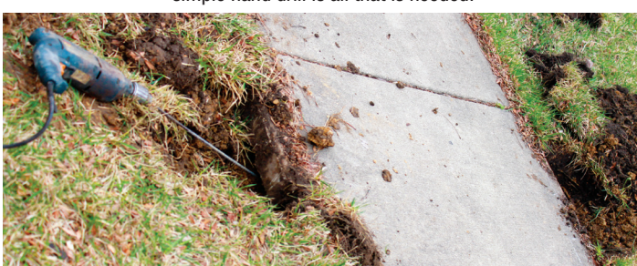
Saves on time, effort, and restoration.